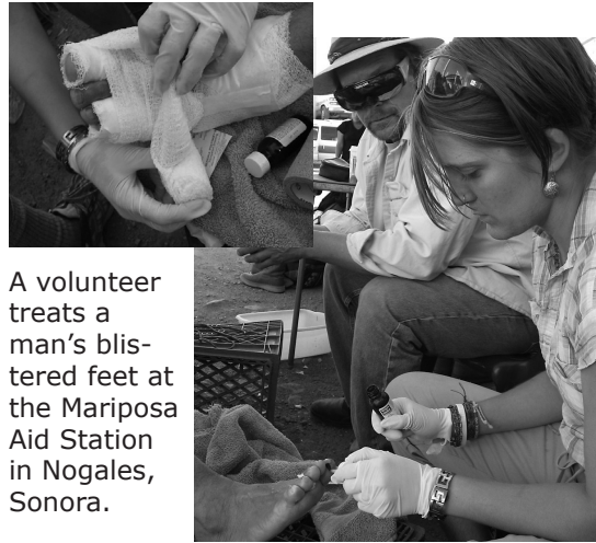
A volunteer treats a man's blistered feet at the Mariposa Aid Station in Nogales, Sonora.

We believe it is essential to be able to provide humanitarian aid to people regardless of their citizenship or legal status. Our work is done with transparency and integrity. We hope to see the end of the deadly economic and border policies soon—but we will continue to provide aid until there are no more deaths .