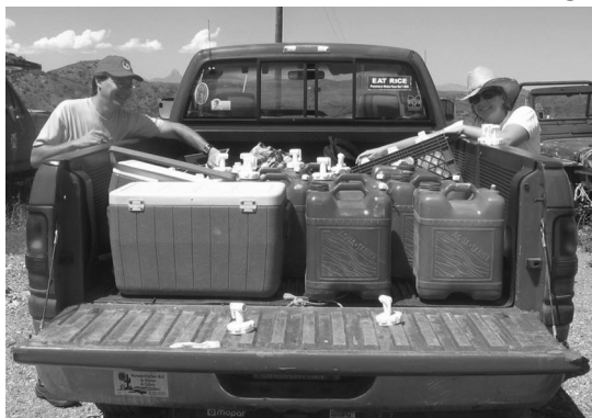
Two volunteers on a water run - jugs must be filled and brought to the camps weekly.

Check our web site for most current needs - www.nomoredeaths.org or write to donations@nomoredeaths.org