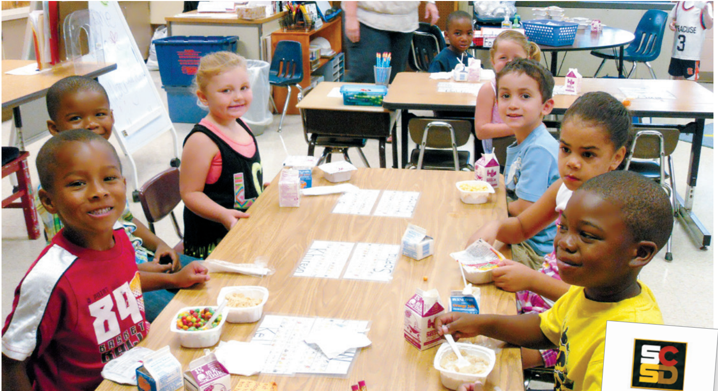
ABOVE: Elementary school students in Syracuse City School District have breakfast in the classroom before classes begin.