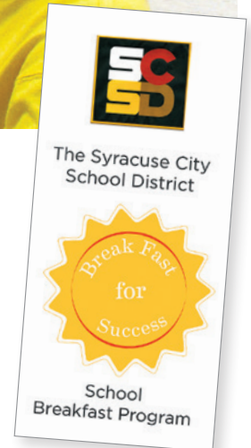
RIGHT: An informational brochure for Syracuse City School District's school breakfast program.