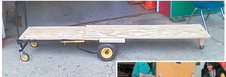
ABOVE: A custodian in Brentwood Union Free School District created an extended cart to help move more cooler bags to more classrooms.