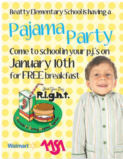
A flyer for one of Riverside Unified School District's successful pajama-party breakfasts includes the Start Your Day R.I.G.H.T logo created by the School Breakfast Team.