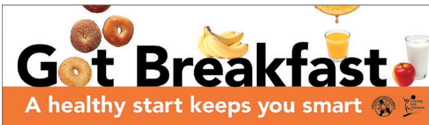
BELOW: Banners like this one from Cincinnati Public Schools are part of the outreach program to increase awareness of school breakfast programs.

giveaways — to encourage breakfast consumption and create excitement and a buzz about the meal so that the breakfast meal would become a habit.