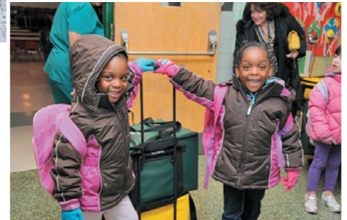
RIGHT: Students in Brentwood help transport the cooler bags into the classroom.

and inventory would be low. Many existing reach-in units were relocated or disposed of due to inefficient operation and age, and the 12 new walk-ins were completed and operational for the start of school in September 2012.