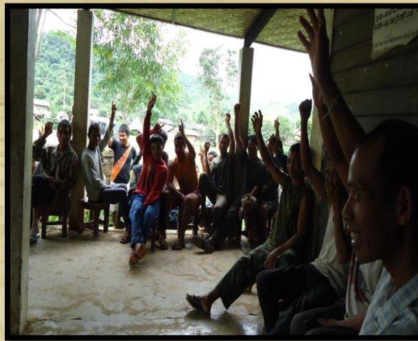
Focus Group in Village Navang

The focus group questions concentrated on sources of income, health practices, water collection methods, latrine facilities, and village expectations