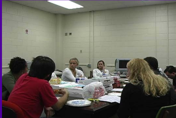
Script writing session