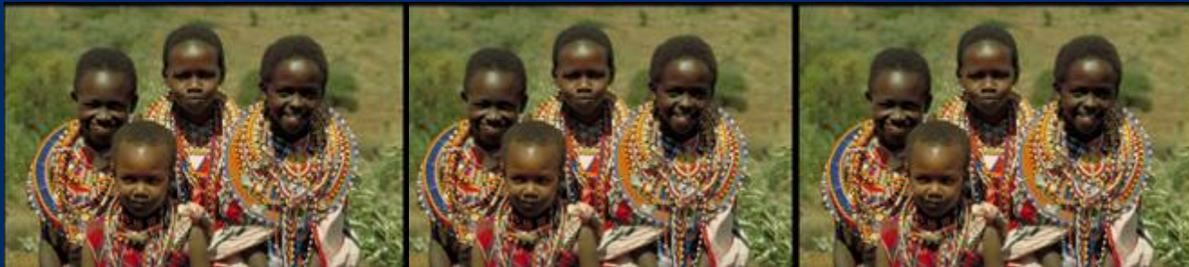
Maasai children, Rift Valley, 1995.