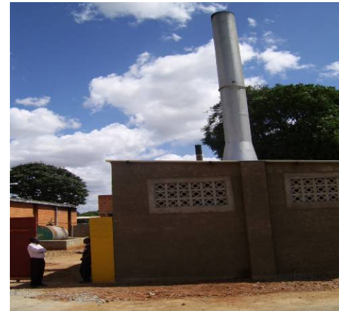
New and bigger capacity incinerator