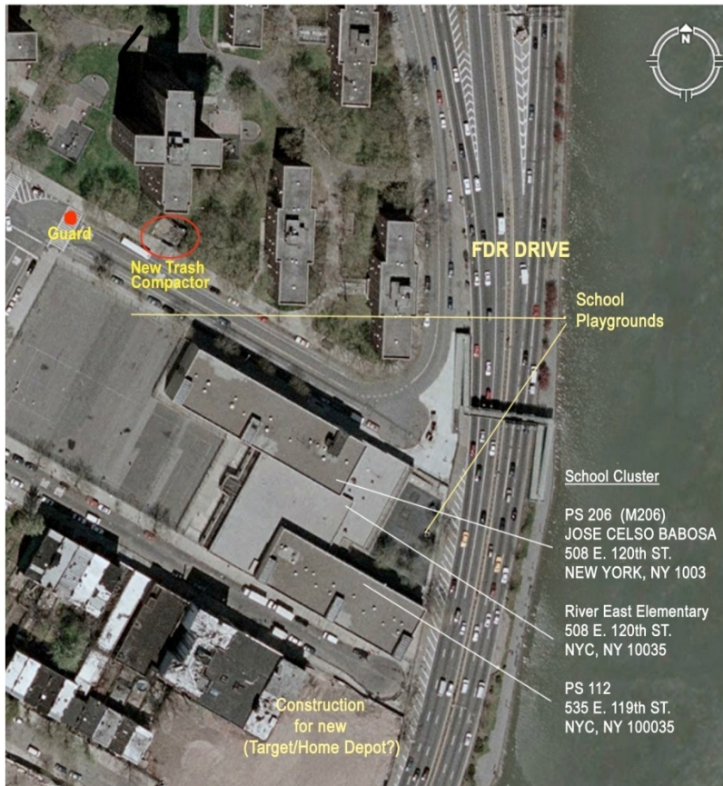
119th & FDR