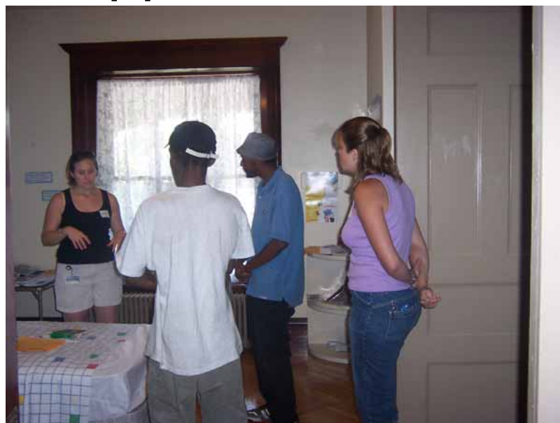
University of Rochester