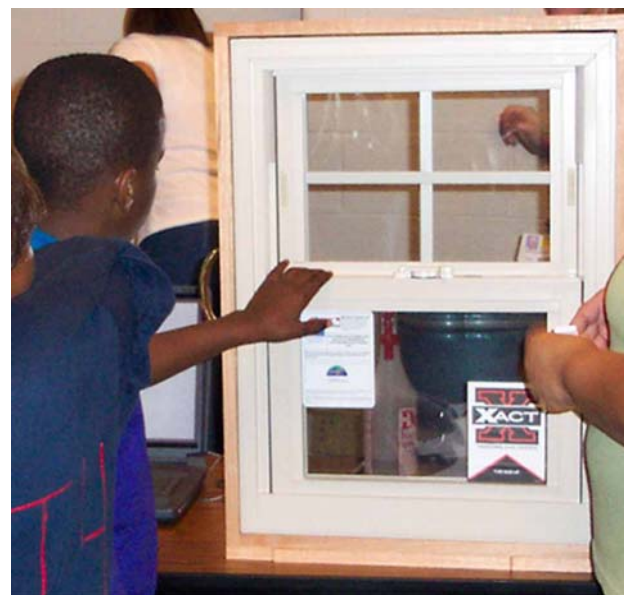
Environmental Health Sciences Center