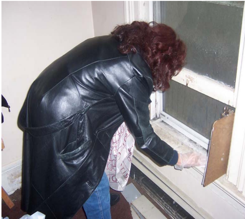
University of Rochester