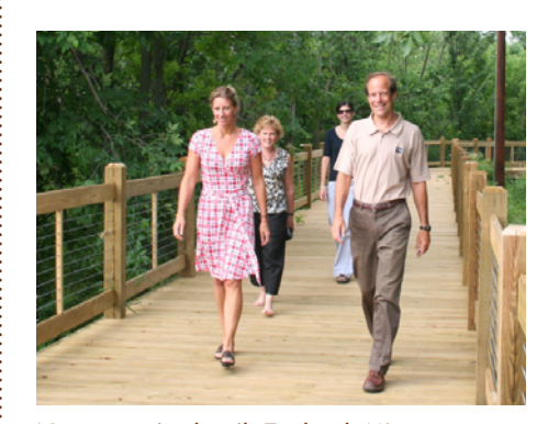
Non-motorized trail: Zeeland, MI

This store expanded shelf space for, and variety of, fruits and vegetables.