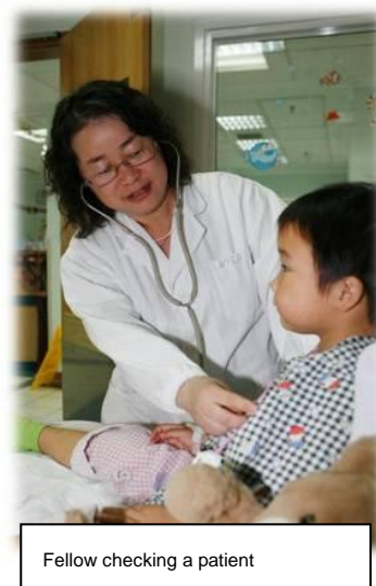
Fellow checking a patient

To ensure quality and track progress, the program uses monitoring and evaluation tools. Furthermore, communications with program alumni are conducted to obtain feedback and track program outcomes.