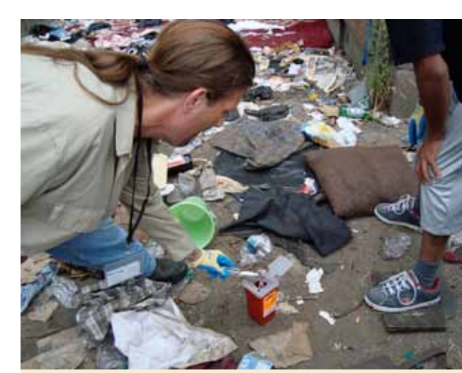
PDSE workers conduct a neighborhood clean-up of improperly discarded syringes.

racial/ethnic disparities in on-going HIV transmission among IDUs and their sex partners due to critical limitations in current syringe exchange coverage.<sup>3 4 5 6</sup>