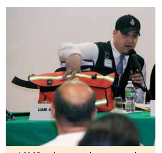
A PDSE worker presenting on outreach strategies for a panel at the First Annual Conference on Peer-Delivered Syringe Exchange held in New York City in April 2010.

Our research supports a widespread understanding that secondary syringe exchange (SSE) is an essential component for expanding syringe coverage and reaching IDUs otherwise unlikely to access SEPs. IDUs have the greatest access to members of their own communities and can easily be trained