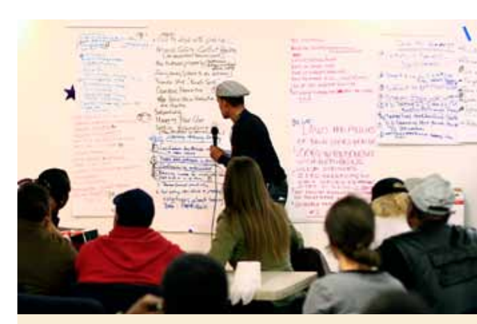
A PDSE worker facilitates an activity at the First Annual Conference on Peer-Delivered Syringe Exchange held in New York City in April 2010.

PDSE formalized limited SSE by allowing SEPs to authorize and train a select number of SEP clients to conduct syringe access services among their peer networks and within their communities.