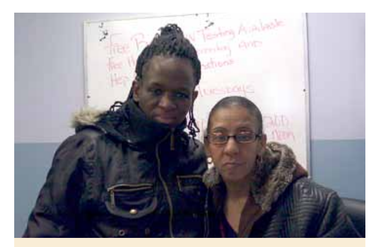
PDSE workers on-call for syringe delivery.

The high proportion of new program enrollments generated via PDSE suggests that more IDUs are being connected to services as a result of this initiative. Workers report that much of early relationship and trust building is built on discussions about general SEP services such as HIV prevention (condom distribution), benefits assistance and case management services—introducing syringe avail-