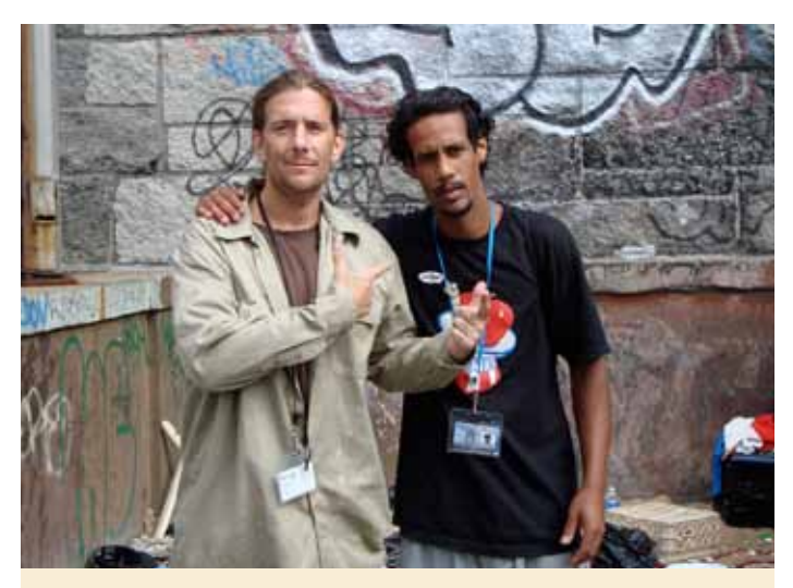
PDSE workers in the field.

Consistent with the well-documented experience of HIV prevention peer delivered services, <sup>19 20</sup> PDSE workers benefit significantly from their participation in the PDSE program, its training and supportive servic-