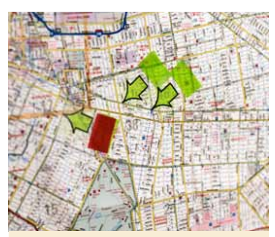
A map indicates locations where PDSE is conducted.

The program is very much needed—and the numbers state that. But—there's not a lot of money to support [the PDSE program]...there's a lot of people who don't know what [PDSE] does and how beneficial it is to the community ...the first line of contact for a lot of issues, not just the syringes. When it comes down to it—a peer does the job, but...some people look down on the peers because of their past, their background or the communities they come from. But...very few people can reach the communities that we reach. But if we're so important...why...I mean, who's better to get paid to do the job than us?