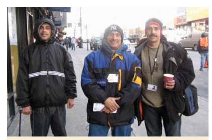
PDSE workers and staff on street-based outreach.

Stationary PDSE outreach is easier to manage from an administrative standpoint, can be safer for PDSE workers and minimizes the pressure placed on individual workers to define boundaries regarding distribution hours. However, this model also limits transaction privacy and may create tension between PDSE workers and SEP staff if they are performing the same functions for different compensation and benefits.