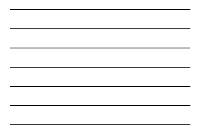
Chart description for slide 14

The chart shows the overall level of activity, capacity, and funding for all respondent sites at three points in time: 1 year before GLS funding, during GLS funding, and 1 year after GLS funding.