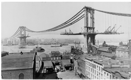
Manhattan Bridge 1909