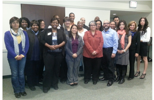
Above: Members of the Community Advisory Council.

In response to growing health inequalities in Chicago, Sinai Health System (SHS) conducted a survey that has changed the way public health data are used in Chicago. In 2002 and 2003, the SHS research arm, Sinai Urban Health Institute (SUHI), collaborated with several community organizations, residents and local leaders to complete one of the largest door to door health surveys in Chicago, titled Sinai's Improving Community Health Survey . In 2014, SUHI was granted $1.4 million by the Chicago Community Trust to complete an even larger community health survey in conjunction with the University of Illinois at Chicago.