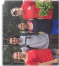
Ho'oulu Aina at Kokua Kalihi Valley