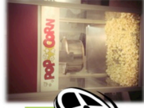
Public Health Movie Night