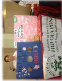
The Condom Fair