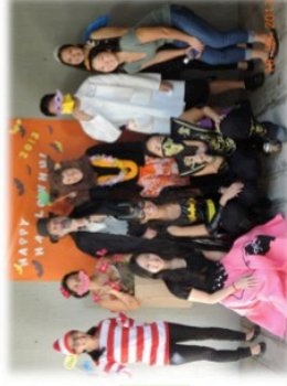
Hui Halloween Hangout