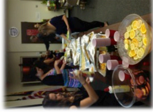
OPHS Holiday Party