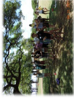
Hui BBQs & Pau Hana