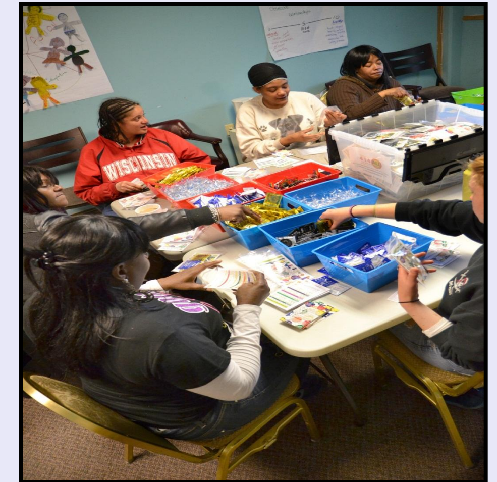
Women package condoms and information about STI testing for distribution at youth centers and clinics