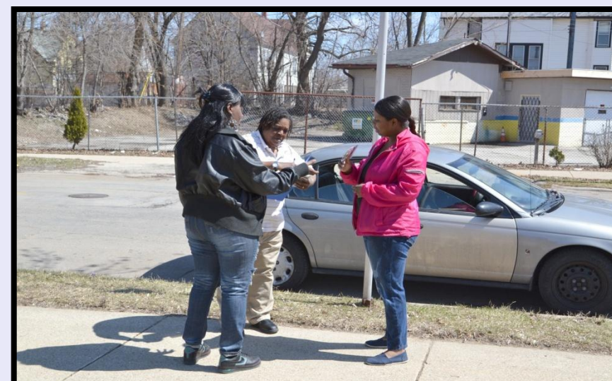
Sisters Outreach workers help women with resources and offer services at the drop-in center

The Sisters Project is a community based program in Milwaukee, Wisconsin designed to help women engaged in street prostitution begin a journey toward a healthier, safer life. The program is a collaborative effort in the Washington Park neighborhood and surrounding areas which have a high incidence of poverty and prostitution.