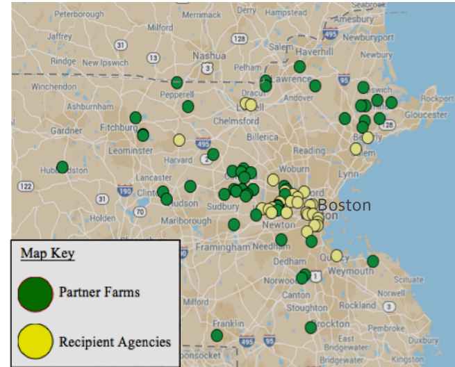
Our Geographic Reach: about 40 miles from our Waltham office.

Total reach: 500+ agencies in eastern MA