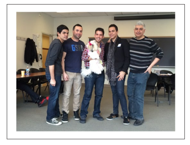
Figure I. Some of the research staff and community partners getting ready for the intervention adaptation sessions.

Data Collection and Analysis. The PI and/or the RA informed potential participants about the study, obtained verbal consent to be screened in a private setting/venue or over the phone, and conducted a screening interview to determine eligibility and willingness to participate. Once a potential participant's eligibility was established, he was asked to invite his main partner to participate. The partner had to contact the PI or the RA to accept invitation to join. Once the partner called or e-mailed the research staff, the PI or the RA conducted the screening. If both of them agreed to participate, they were invited and scheduled for the first intervention adaptation session.